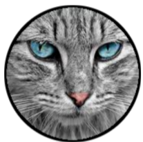
272 x 185 px